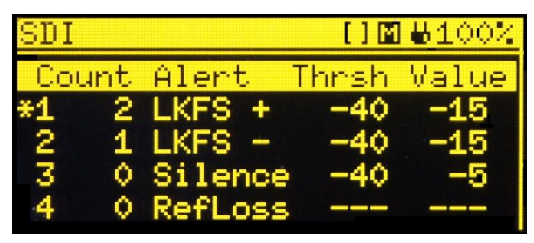
Figure 3 - Alert Status Display

The status of the Alerts may be monitored on the MT2000's display as well. Please refer to MT2000 User Guide for further information regarding this functionality. The Alert Status display is at the top of the Alert submenu.