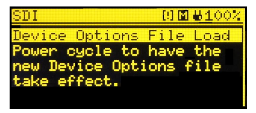
Figure 7 - Instruction to Power Cycle

7. When prompted, remove the USB thumb drive and power cycle the MT2000